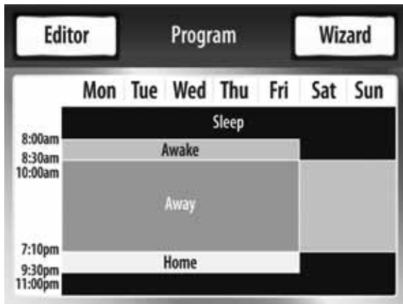
Program summary screen